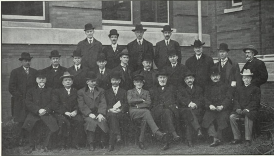
THE COUNTRY LIFE COMMISSION AND PARTY WHICH VISITED ITHACA ON DECEMBER 16, 1905. THE FIVE MEMBERS OF THE COMMISSION PRESENT OCCUPY THE CENTER OF THE LOWER ROW.